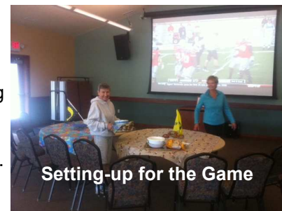
Setting-up for the Game

For more information on winter promotions and reservations call the Resort at 541.271.0287